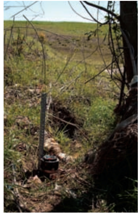
A removable lid stopper keeps rain from entering a system through its top.

A screen in the bottom allows a sampler to note any trapped materials such as vegetative matter and trash. The lid has a stopper to prevent rainfall from directly entering the top of the system. When the bracket is installed